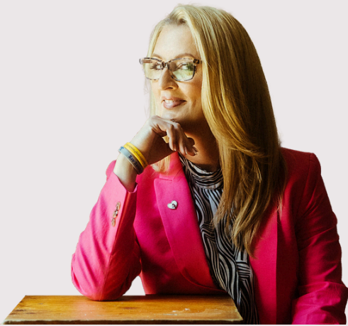
SPEAKER & COACH